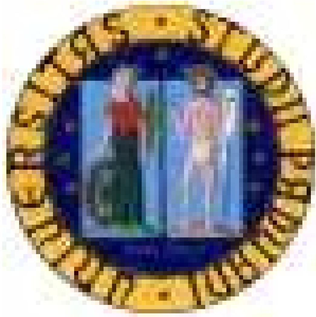
First Figure Caption